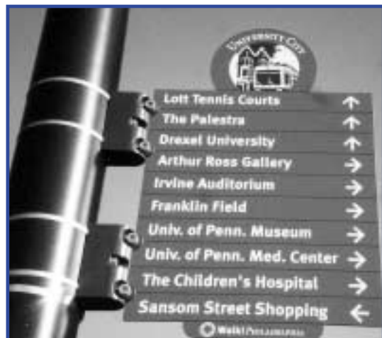
Close up of WALK!Philadelphia® sign.