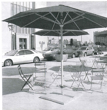
Photos of the Porch and the dedication celebration