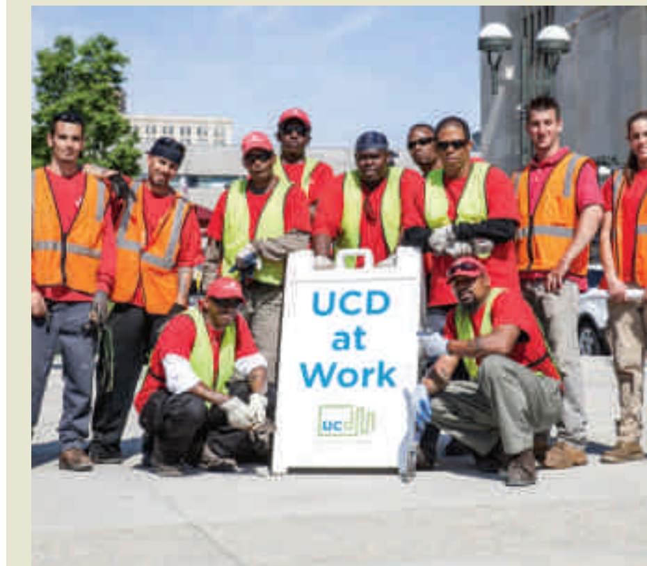
Our seven hard-working crewmembers shown above, weeded, cleaned, added soil, mulch, and thousands of plants at The Porch, all along Baltimore Avenue, University Avenue, and Market Street.

The West Philadelphia Skills Initiative Landscape program gave UCD a botanic facelift this spring. Working with ValleyCrest, the nation's largest integrated landscape company, our landscape interns learned valuable job training while helping to ready our neighborhood for summer with unique and beautiful plantings.