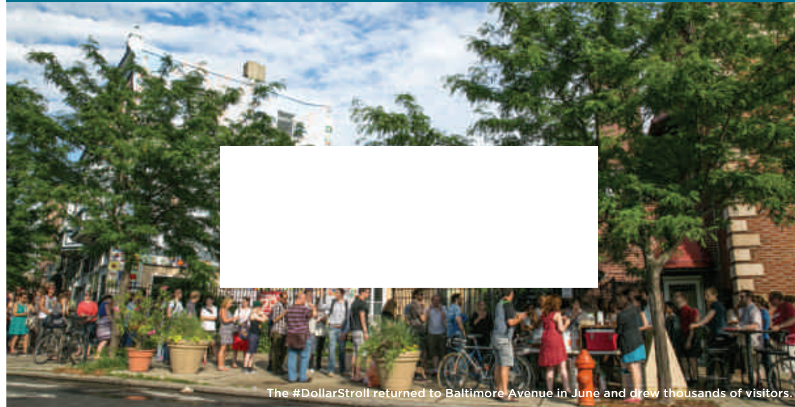
The #DollarStroll returned to Baltimore Avenue in June and drew thousands of visitors.