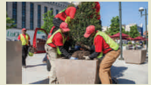
The WPSI Landscape Crew hard at work, removing the winter plants from The Porch and preparing for the big Summer planting change out.